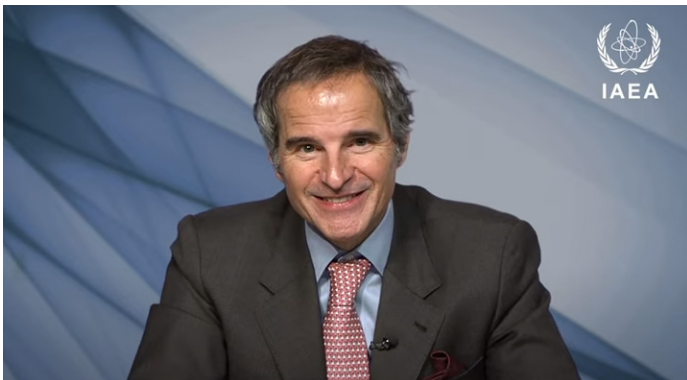
Remarks by Mr Rafael Mariano Grossi, IAEA Director General

As Mr Rafael Mariano Grossi said in his video, we wish you all a very happy centenary of the RCA! ✓