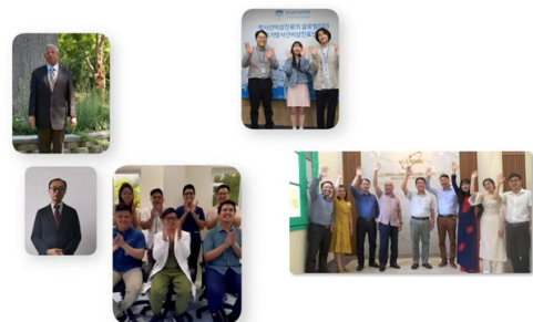
Celebratory messages from RCA family members